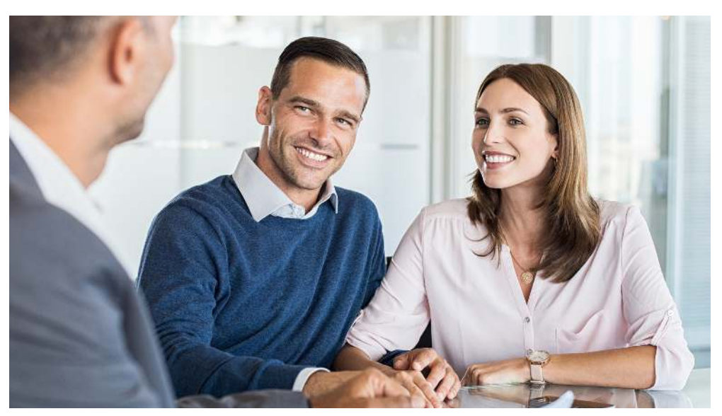
(continued from page 3)

Click here to read the rest The Definitive Guide to Retirement Income-from the News You Can Use Section of TheRetirementIncomeStore.com